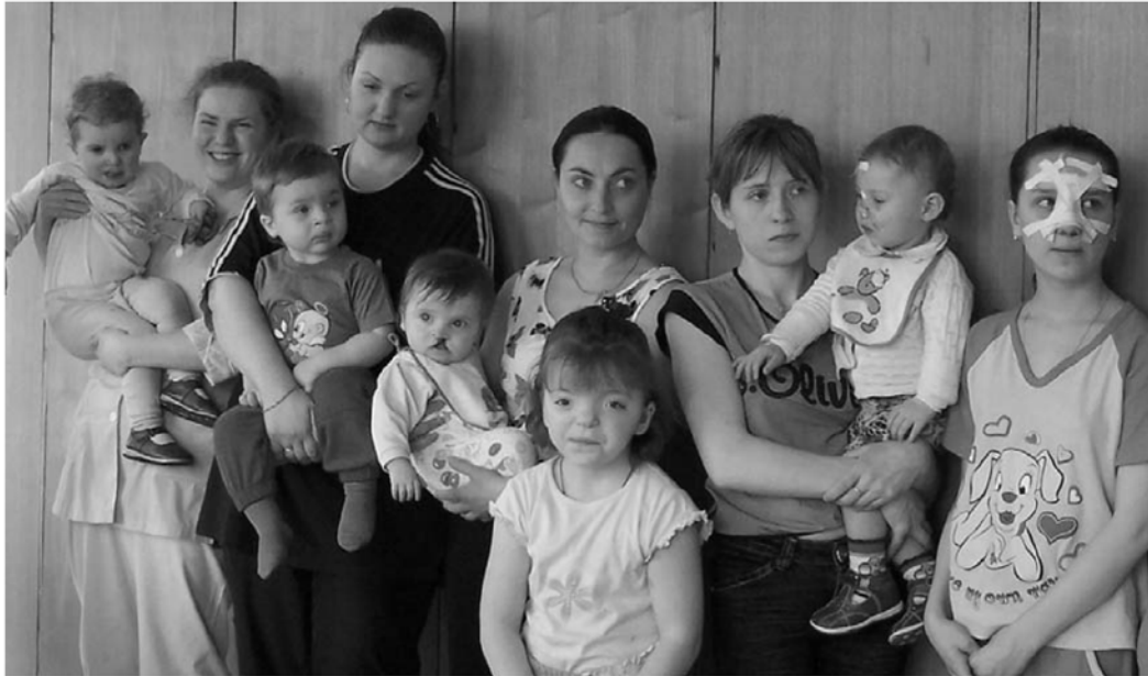
Patients at the Moscow Center for Maxillofacial Surgery

In Russia, each year over 30,000 children are born with facial deformities or abnormalities of the skull. Another 20,000 children experience such defects due to trauma or illnesses developed after birth. Due to the financial burden ($2,500- $5,000 USD per operation) and the lack of specialized doctors, most children with such disfigurements are left untreated. The unsightly appearance of children with maxillofacial problems causes various maladaptive behaviors. Children are ostracized socially and within their own families. As many as 10% of affected Russian children are abandoned by their parents and placed in state orphanages.