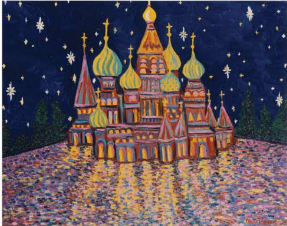
The Night of St Basil's , 1995. Oil on linen. 25 5/8 x 31 7/8 in. (65 x 81 cm)

The Ana Tzarev Gallery is honored to support the